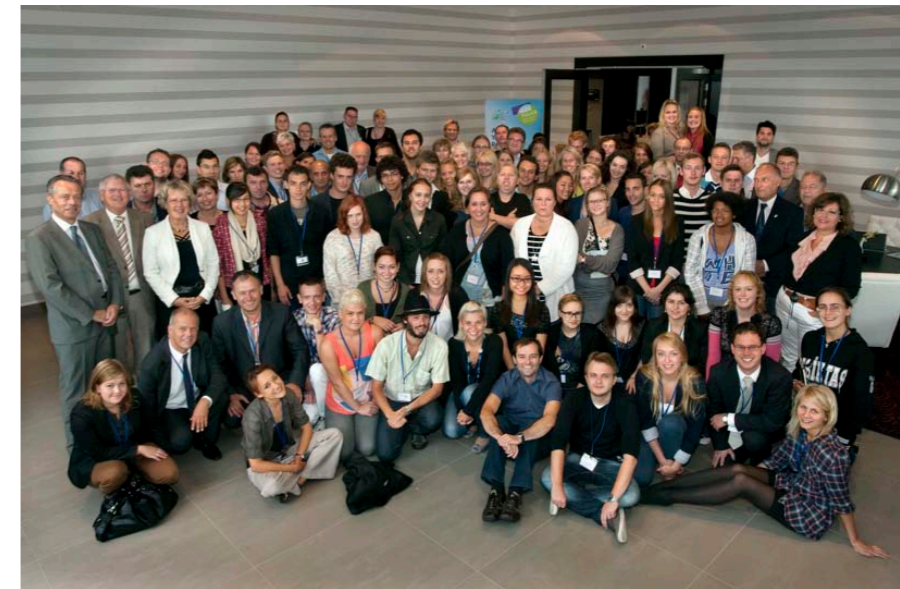
AER Summer Schools