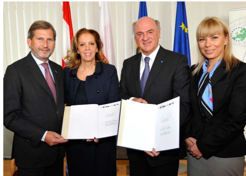
St.Pölten Manifesto, 21 October 2011

towards all relevant institutions, including bilateral meetings with members of the European Parliament and officials of the Commission